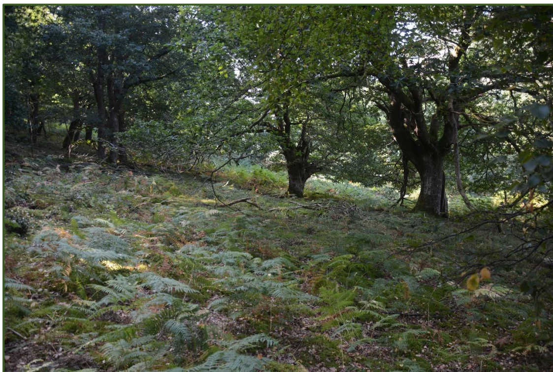
Figure 3. Cwm yr Esgob (SU1) Informal wood-pasture with veteran Sessile Oaks.