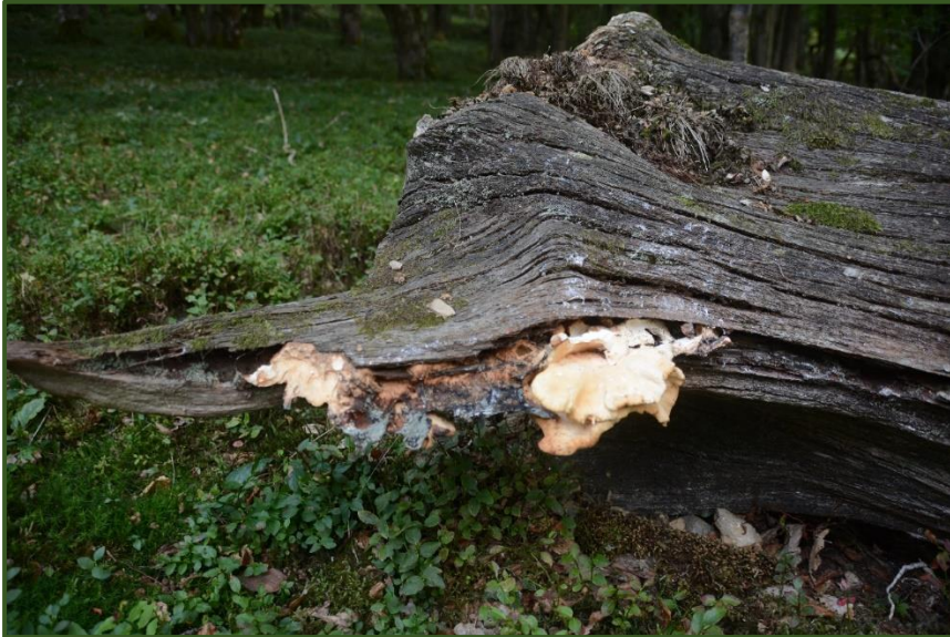
Figure 4. Cwm yr Esgob (SU1) Chicken-of-the-woods brackets on fallen oak branch.

This report sets out findings of the work carried out in 2022. The methods used to undertake the survey are laid out in Section 4. The results are presented in Section 5, which includes a list of all the invertebrates recorded during fieldwork at Carn Gafallt in 2022. Sub-section 5.1 provides short accounts of any key species found during the survey. These include brief notes on their identification, British distribution, ecology and occurrence at Carn Gafallt. In sub-section 5.2, the key species list is used to identify key invertebrate habitat features at Carn Gafallt. This sub-section also analyses the importance of dead wood invertebrate assemblages at Carn Gafallt using the Revised Index of Ecological Continuity (RIEC) and the Saproxylous Quality Index (SQI). Section 6 gives some conclusions on the overall importance of the site for invertebrates and Section 7 lists management works that aim to maintain and enhance the importance of the site for dead wood invertebrates.