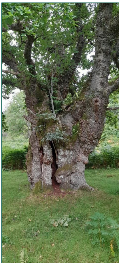
Figure 2. Veteran oak, Cae-melyn (SU4).