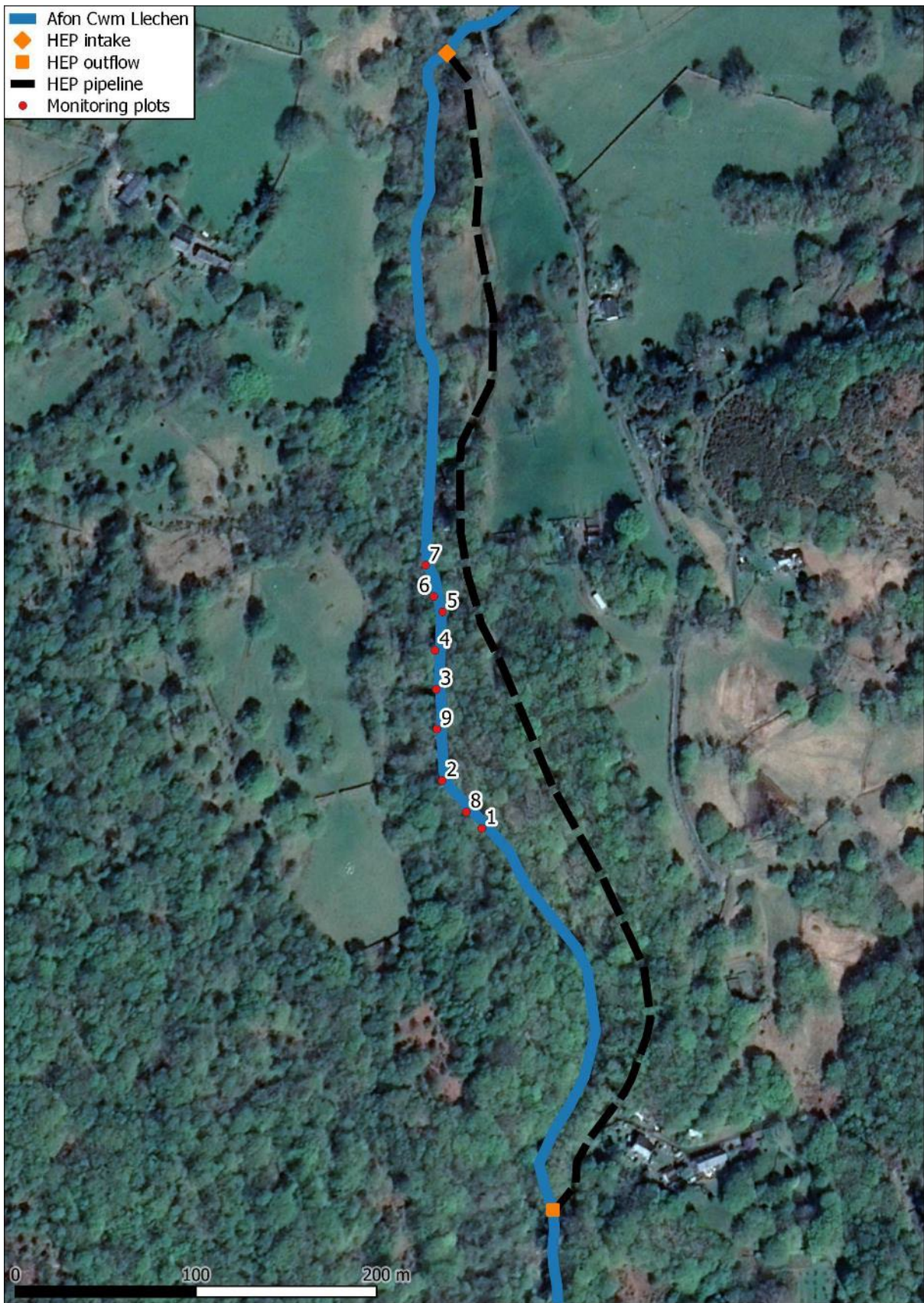
Figure 1. Location of study site and HEP scheme. Monitoring plots are distributed throughout the main length of Bontddu Gorge.